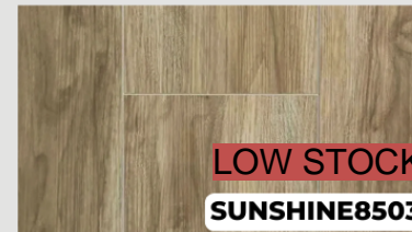
LOW STOCK SUNSHINE8503