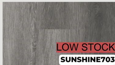
LOW STOCK SUNSHINE703